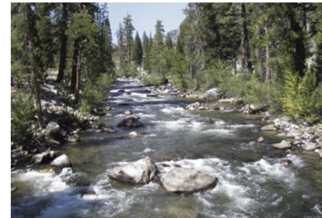
Upper Kern River above Johnsondale Bridge.

CONSERVATION RECOMMENDATIONS: Issues that need to be addressed for conserving Kern River rainbow trout include stopping the planting of non-native trout, curbing grazing in riparian areas, and decreasing heavy recreational activities in the Kern River basin that adversely impact the fish's habitat.