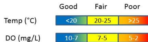
Figure 1. Southern California steelhead/ rainbow trout water quality tolerance range estimates. Data compilation by S. Jacobson, CalTrout, pers. comm. 2016.

Preferred temperatures of juvenile steelhead are reported as 10-17°C, but southern steelhead seem to persist in environments that regularly reach temperatures outside this range. For example, Carpanzano (1996) found steelhead juveniles in the Ventura River persisted where temperatures peaked daily at 28°C. Santa Ynez steelhead trout have been observed at temperatures of 25°C (SYRTAC 2000). In Sespe Creek, Matthews and Berg (1997) found that trout selected cool seeps in flowing water or areas of pools that had lower temperatures despite associated low oxygen levels. Spina (2007), in contrast, found that thermal refuges were often