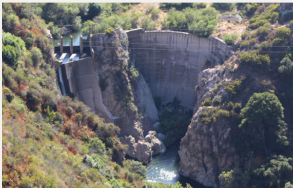
Rindge Dam.