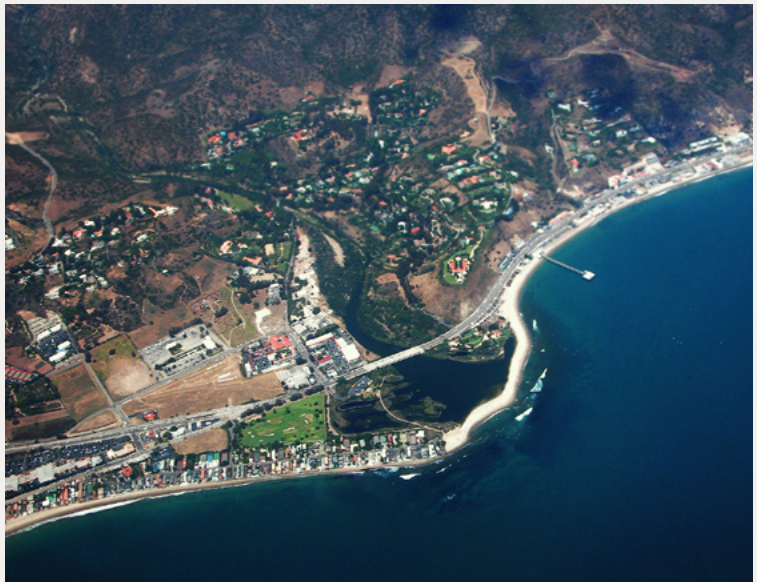
Downtown Malibu and surrounding neighborhoods, 2008.