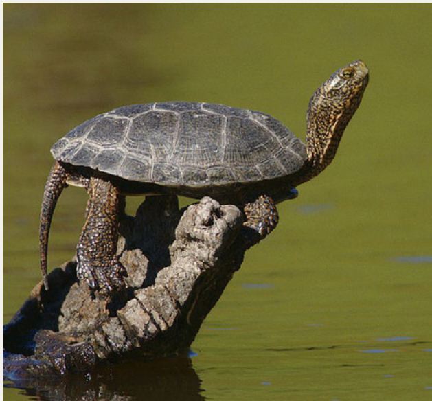
Western Pond Turtle